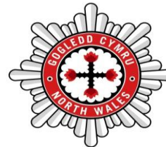
Gwasanaeth Tân ac Achub Fire and Rescue Service